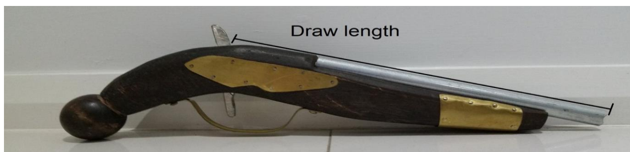
Figure 1. RBG Draw length