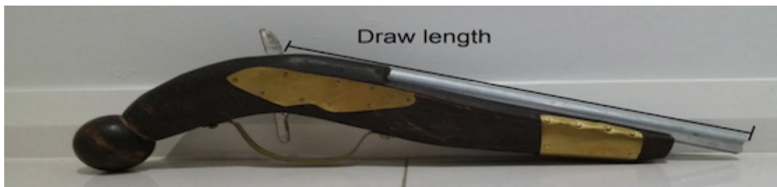
Figure 1. Rubber band gun draw length.

This is the distance between the anchor point and the trigger that the rubber band gun ammunition hooks onto. In most rubber band guns that will be the distance between the front of the barrel and the trigger (see Fig 1.).